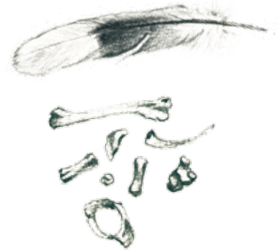
feathers, shells, or bones