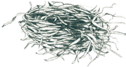
pieces of homes (bird nests, spider webs, etc.)