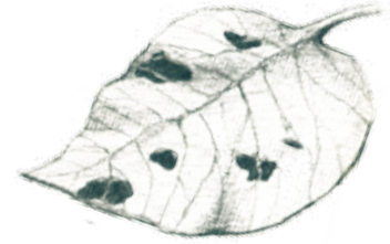
broken or chewed plants