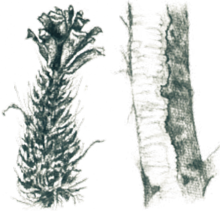
chewed pinecones, nuts or tree bark