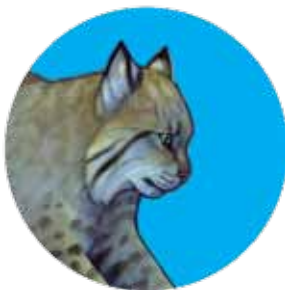
bobcat: Lynx rufus