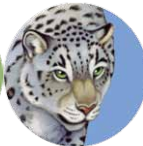
snow leopard: Uncia uncia